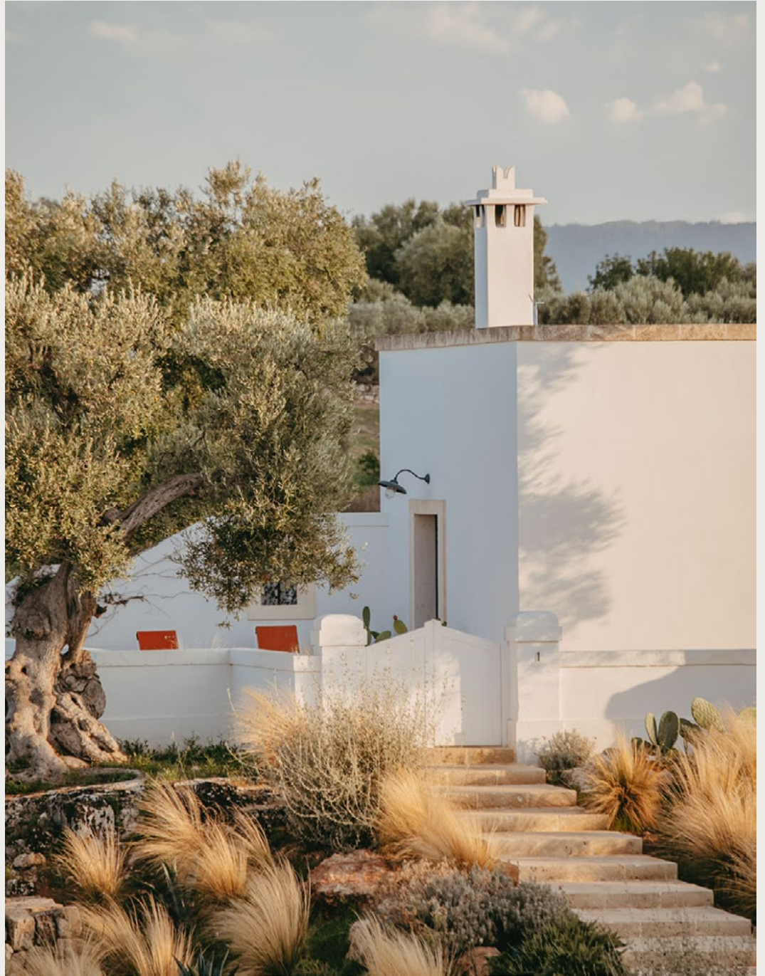
II: THE MASSERIA