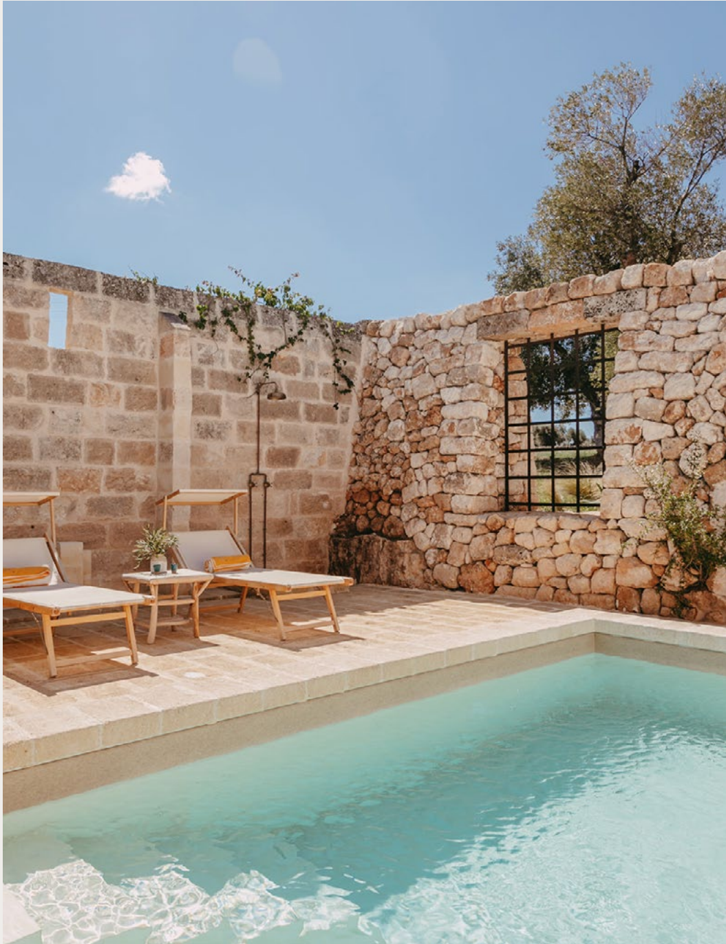
WEDDINGS AT MASSERIA CALDERISI